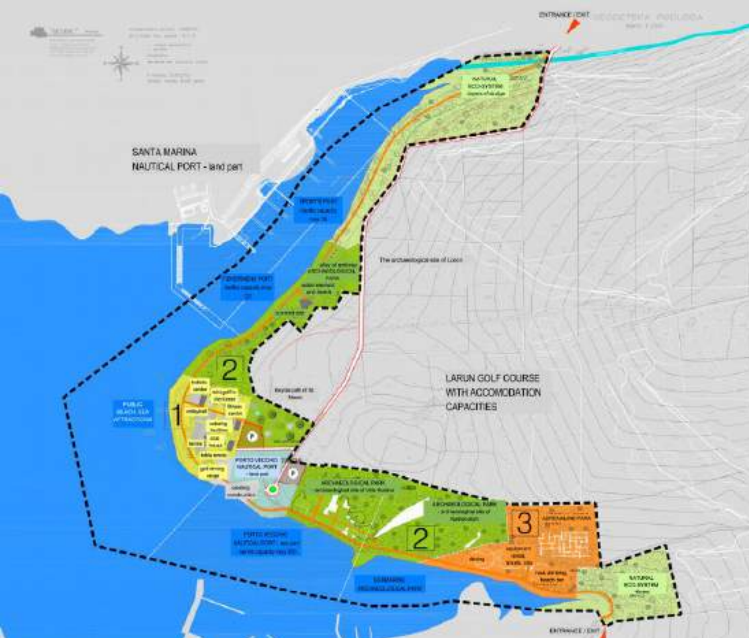
The basic concept of the possible solution for the coastal area