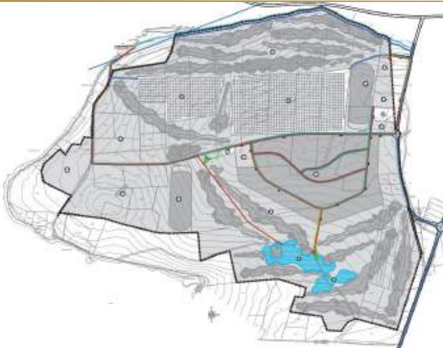
Water supply and drainage - Map from Urban Development Plan

One of important achievements in pre development phase of the project refers to signed ToR that grant a permission to water purifier connection, funded by the European Union, as of last year fully operational in jurisdiction of Tar Vabriga Municipality. Therefore, by using water from that purifier we have secured less expensive irrigation of the golf course that will save a substantial amount of money and align with sustainable principles of the project.