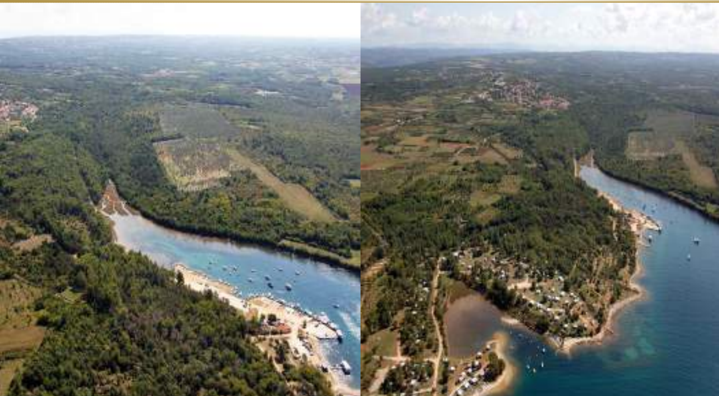
View of the Santa Marina bay next to the project area